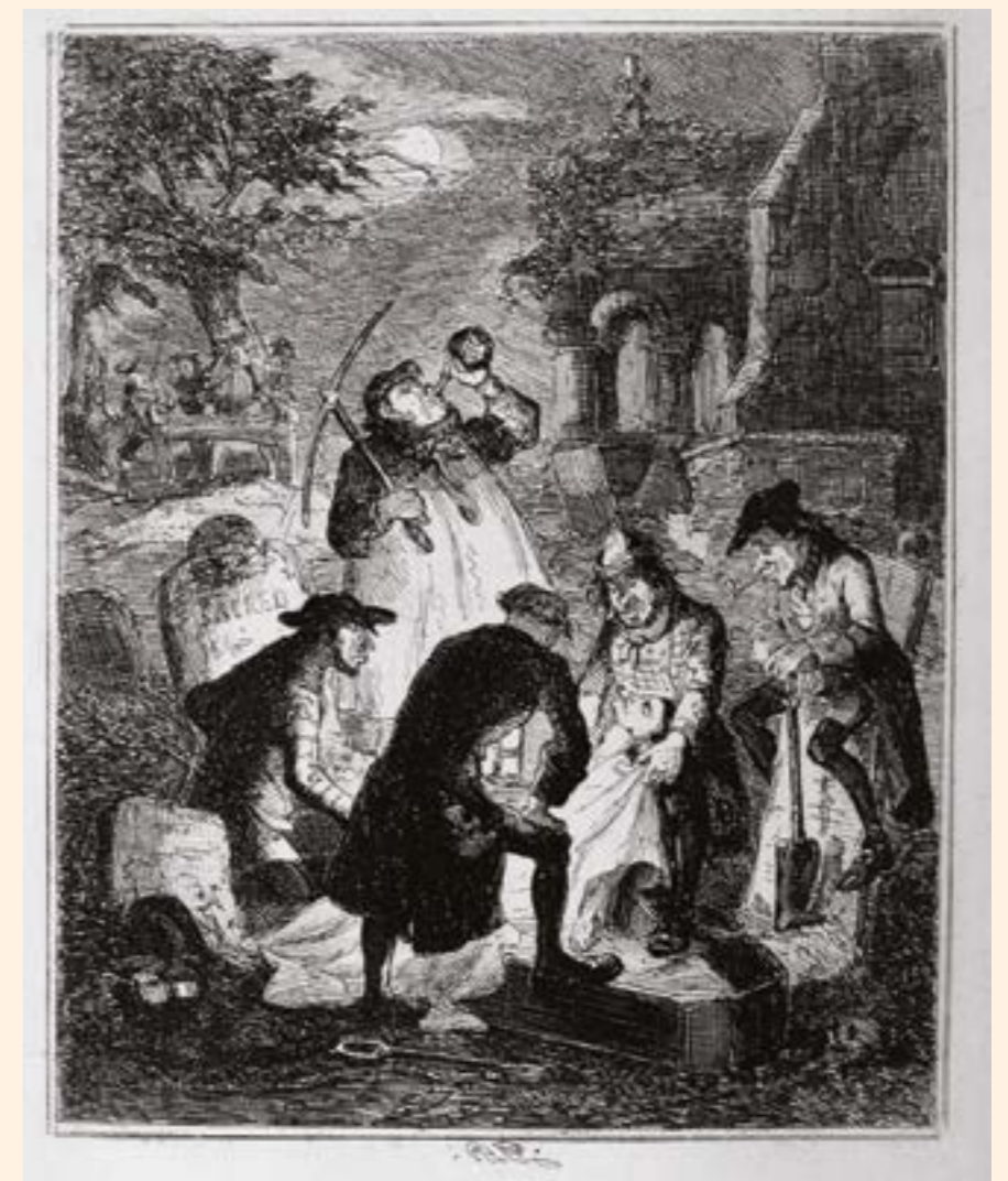
Grave robbers drinking on the job. Resurrectionists