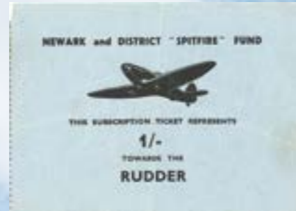
This ticket, in theory at least, would have contributed 1s towards the cost of a Spitfire's rudder (Inspire Nottinghamshire Archives, DD/NM/3/2/5).

The Gleaner telephoned the Ministry of Aircraft Production asking how much a Spitfire would cost and was given the figure of £5,000. Although the actual cost was in fact closer to £12,000, it was decided that £5,000 was to be the utmost amount of