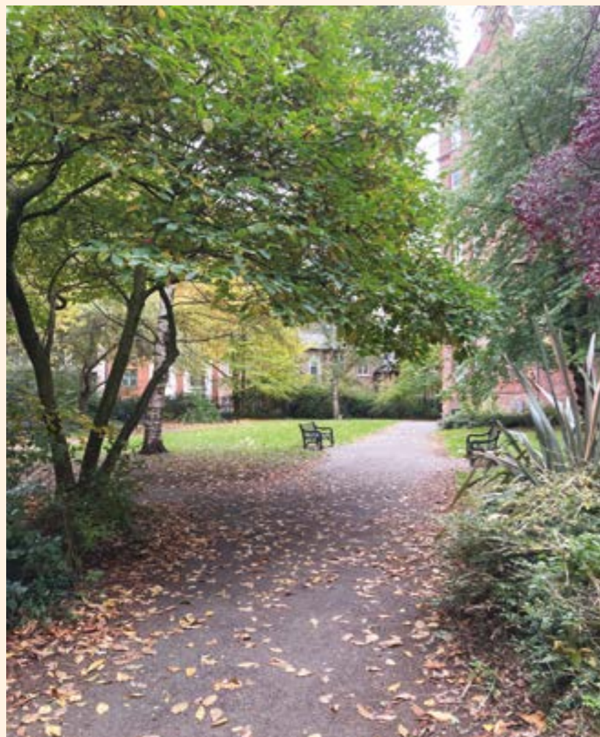
The garden of rest, Barker Gate. All that is left of the three burial grounds targeted by the Resurrectionists.

Resurrectionists needed information about recent interments (the anatomists only wanting fresh corpses), information they often purchased from local accomplices. In Nottingham suspicion fell upon St. Mary's gravedigger, as recorded in the diary of John Rainbow, governor of the house of correction: