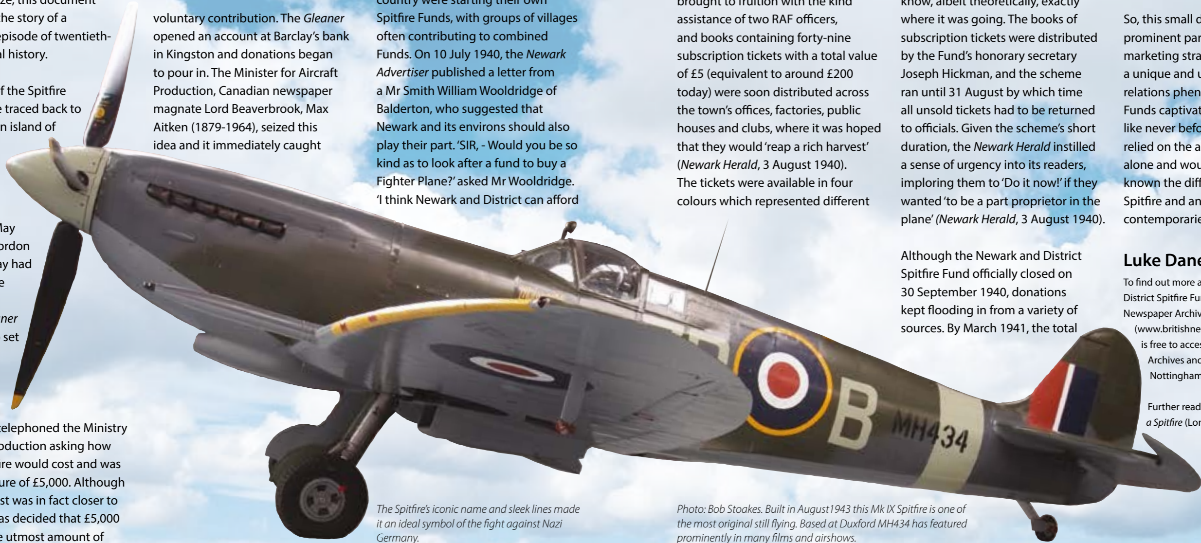
The Spitfire's iconic name and sleek lines made it an ideal symbol of the fight against Nazi Germany.